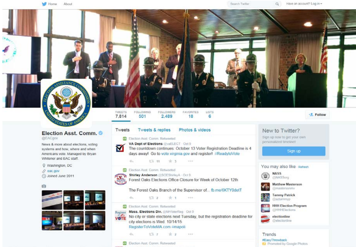
Note: screen shot as of October 15, 2015