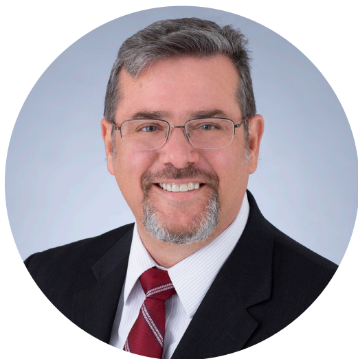
COMMISSIONER Donald L. Palmer